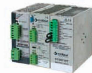
Example 2: XCSF120C + XCSUPS1 + XCSBP30Y