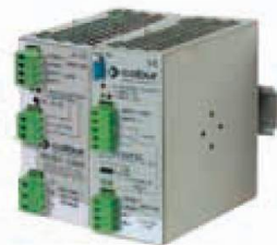
Example 1: XCS120C + XCSBP30Y

PR/3/AC, PR/3/AC/ZB, PR/3/AS, PR/3/AS/ZB