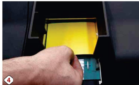
4 Place the labels directly onto the printing surface.