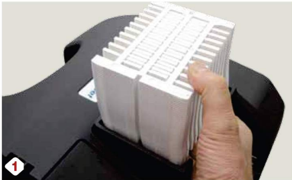
1 Insert the material in the loader.

To print onto remnants or articles that cannot be used with the automatic loader (e.g. adhesive tags), place the articles directly onto the printing surface past the pushers.